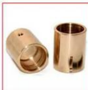
CNC Stainless steel