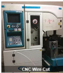
CNC Wire Cut