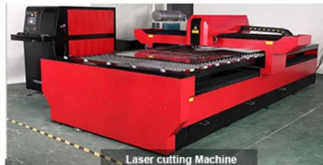
Laser cutting Machine