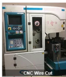
CNC Wire Cut