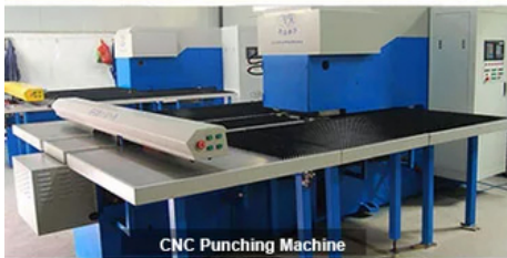
CNC Punching Machine