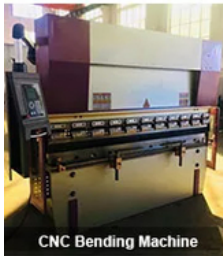
CNC Bending Machine