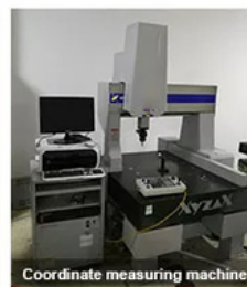
Coordinate measuring machine