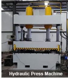
Hydraulic Press Machine