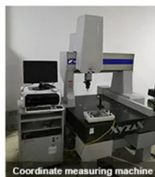
Coordinate measuring machine